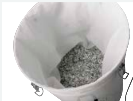
Trims inside the container