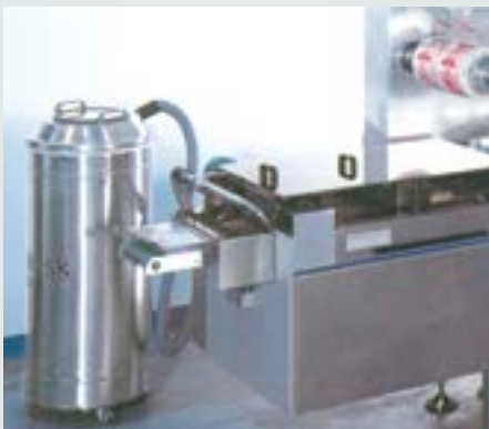
Collection of trims from packaging machine