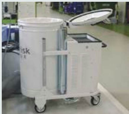
Power and capacity in a trim-extractor