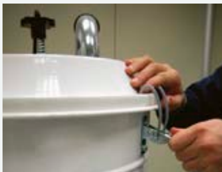
Easy maintenance/replacement of the filter