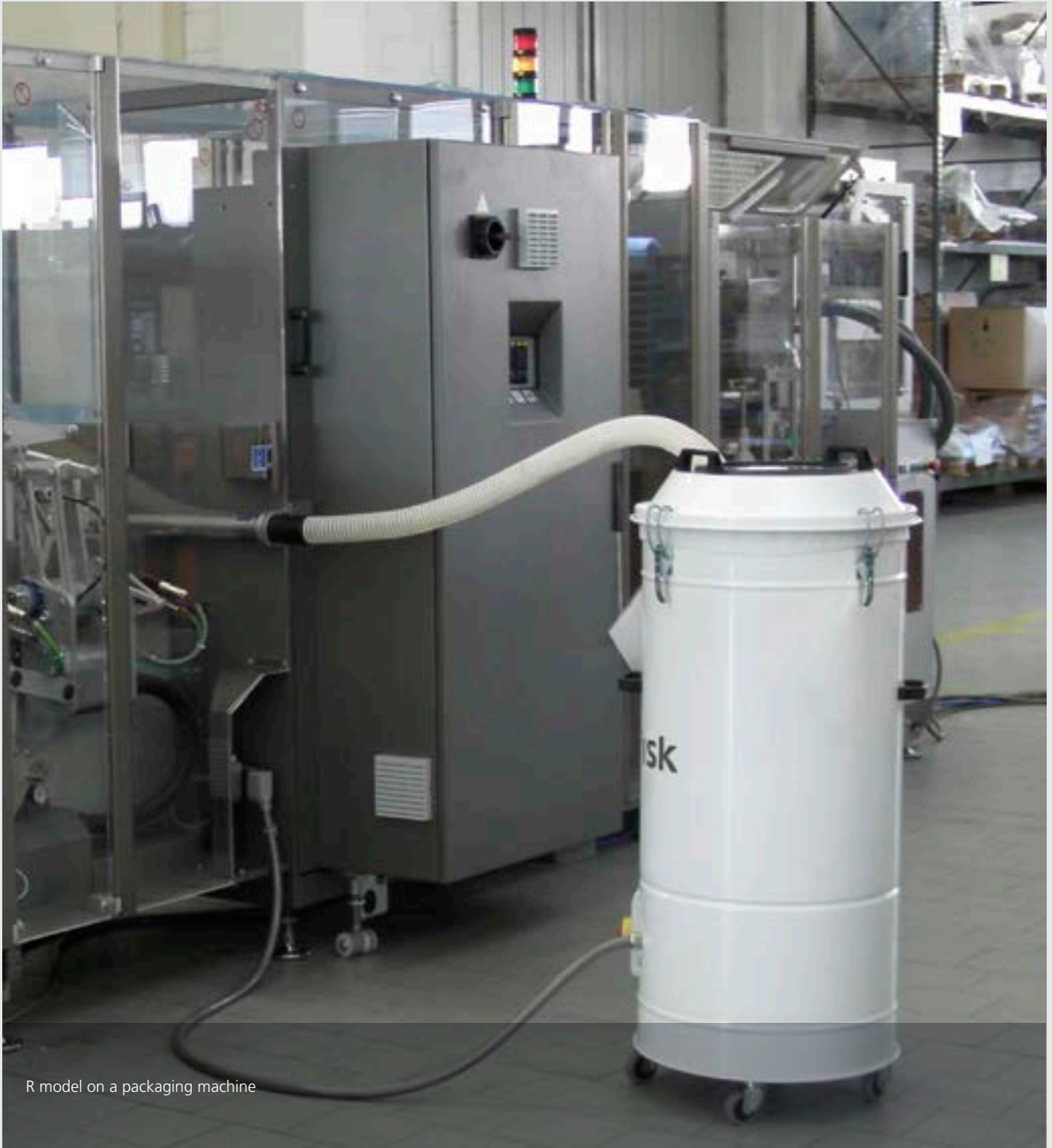
R model on a packaging machine