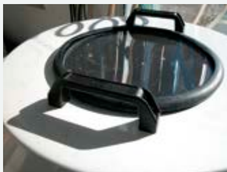
Window to control the trims level