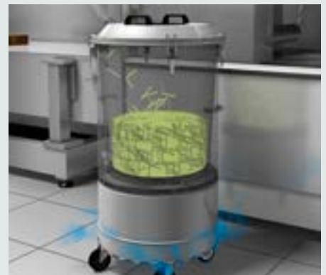
To exploit the total container capacity, trims are progressively compacted on the bottom of the container