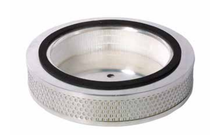
Upstream absolute filter

Visit the site www.nilfisk.com for a free accessories catalogue, including optionals and separators for your vacuum: you'll find the perfect solution to meet your own specific requirements.