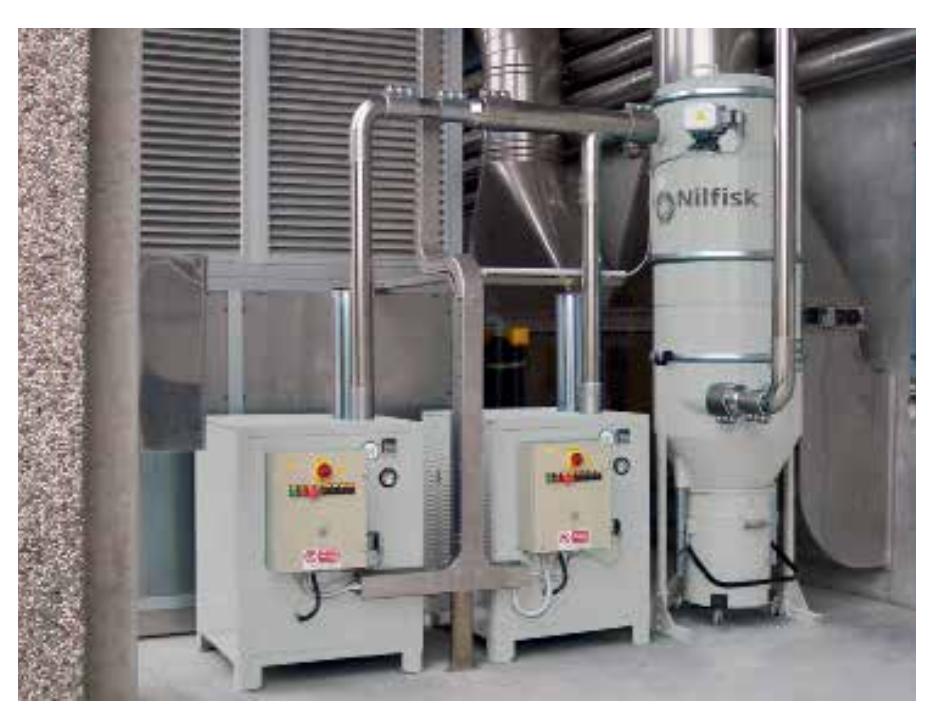
Centralized vacuum system in a chemical company: 2 vacuum units,1filter silo.

Centralized vacuum systems are the ideal solution for vacuum applications required in several places simultaneously, and in large environments that may have very different features. ATEX certified systems are often the only choice for large industrial production.