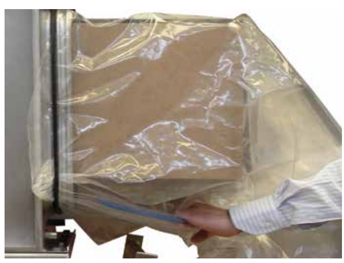
Bag-In Bag-Out filter system