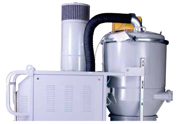
Air outlet diffuser