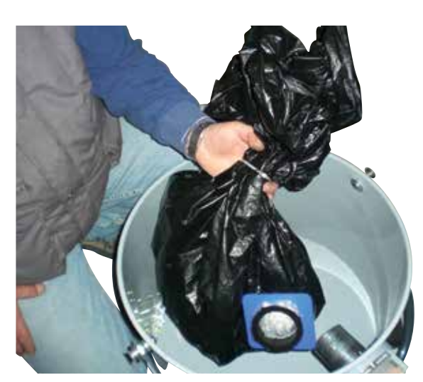
Safe Bag filter