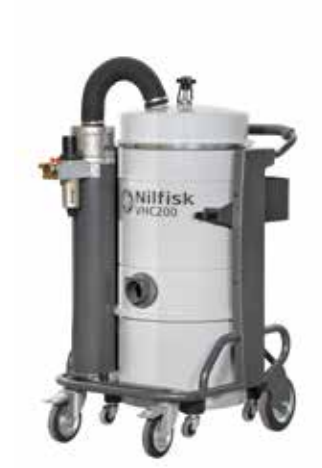
Single-phase up to 4 kW