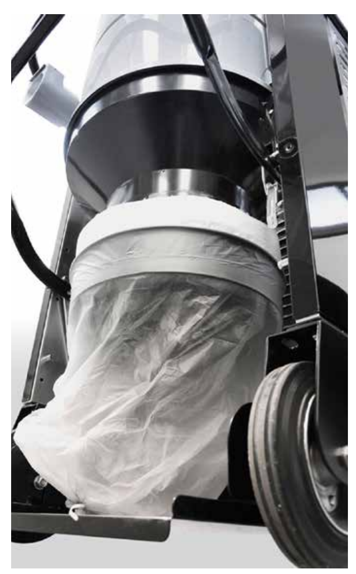
Longopac® "endless" collection system