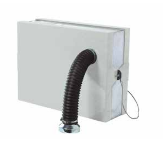
Downstream HEPA filter