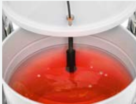
Liquid cut-off system