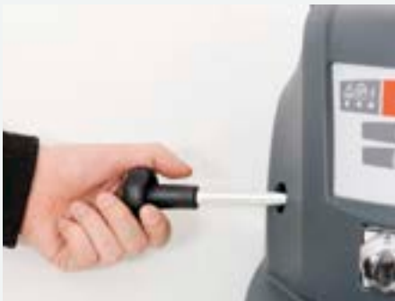
Manual filter shaker