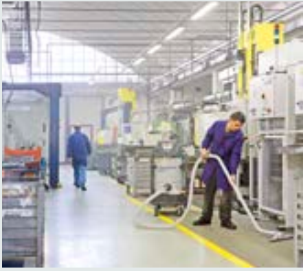
Cleaning of a metal company