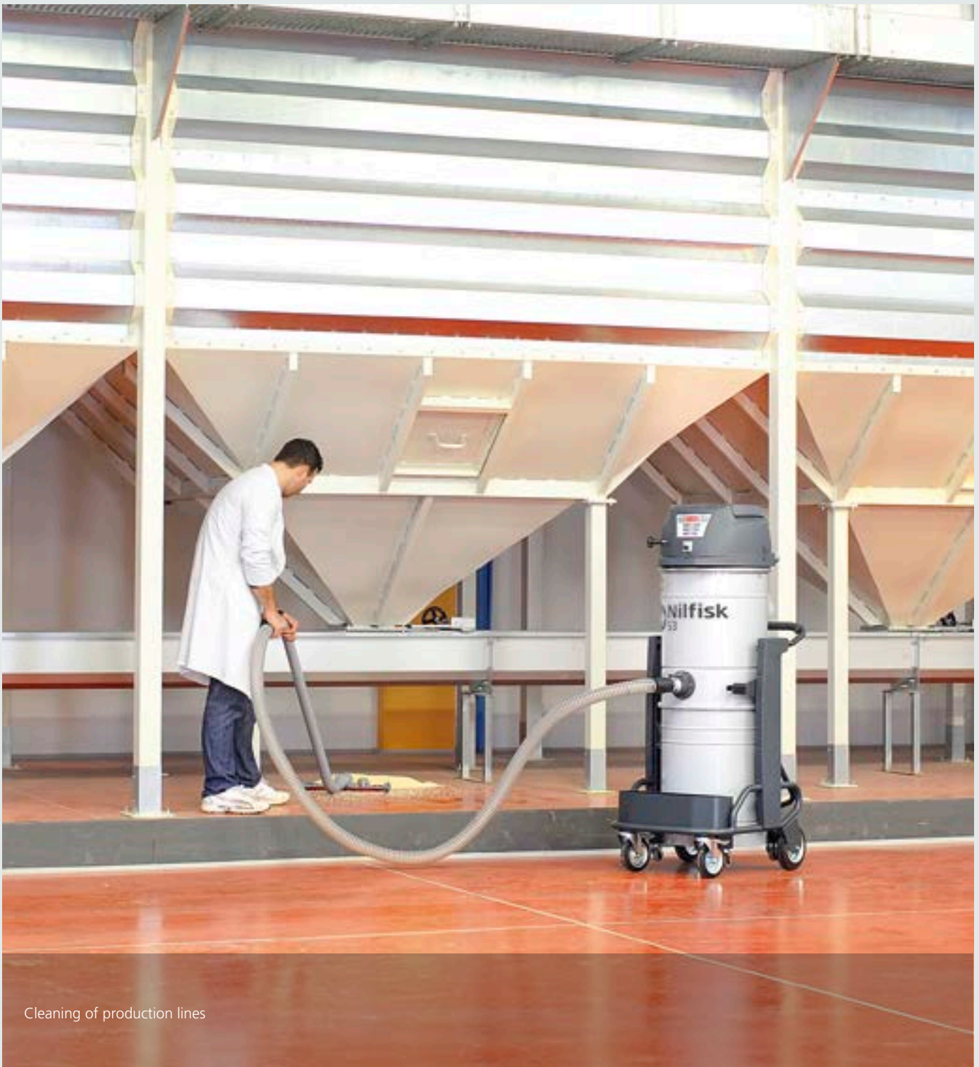
Cleaning of production lines