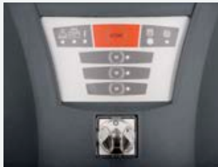
Electronic board control