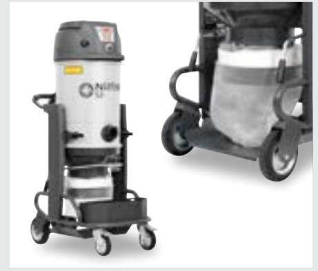
S3 with gravity unload system with Longopac®