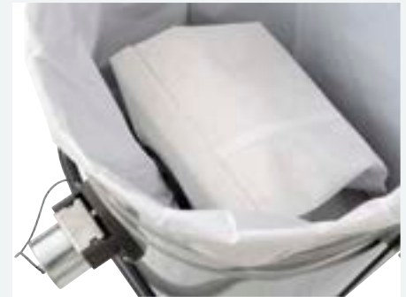
Safe bag for toxic material