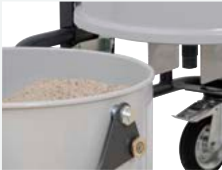
Solid cut-off system